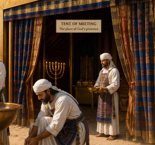
TENT OF MEETING The place of God's presence