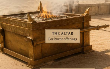
THE ALTAR For burnt offerings