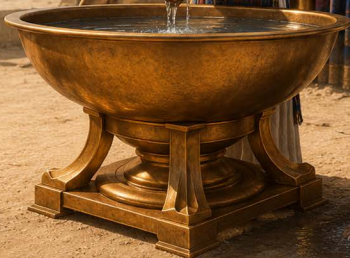
THE BRONZE BASIN For washing with water

The basin was to be placed between the tent of meeting and the altar.