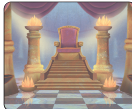
Illustration: © 2014 by David C. Cook. All rights reserved.

Copyright © 2014 by David C. Cook. All rights reserved. Unit 20 • Session 3 Before the Throne