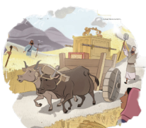
THE ARK RETURNS