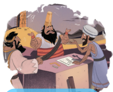
TOWER OF BABEL