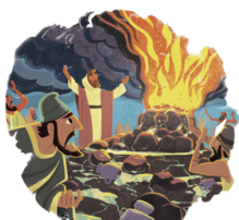
ELIJAH & MT CARMEL