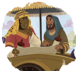
PHILIP & THE ETHIOPIAN