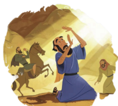
PAUL MET JESUS