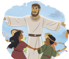
CHILDREN OF GOD