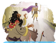
BALAM & BALAK