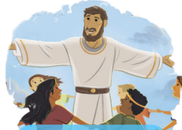
CHILDREN OF GOD