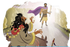
BALAM & BALAK