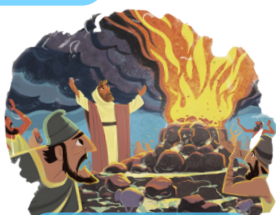
ELIJAH & MT CARMEL