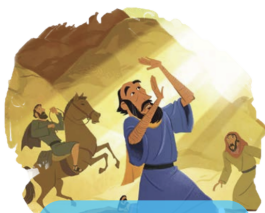
PAUL MET JESUS