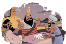
TOWER OF BABEL