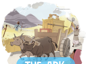
THE ARK RETURNS