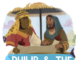
PHILIP & THE ETHIOPIAN