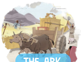
THE ARK RETURNS