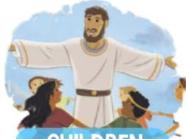
CHILDREN OF GOD