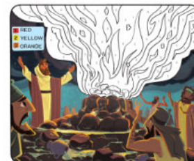
Illustration © 2010 by Thomas Nelson Unit 13 - Semester 2 Elijah at Mount Carmel

Use the numbers key to help you color the fire that God sent from heaven.