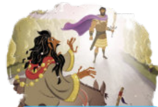
BALAM & BALAK