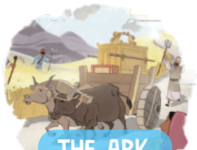
THE ARK RETURNS