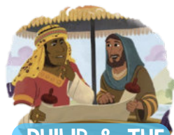
PHILIP & THE ETHIOPIAN