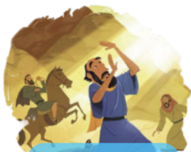
PAUL MET JESUS