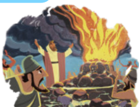
ELIJAH & MT CARMEL