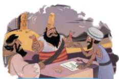
TOWER OF BABEL