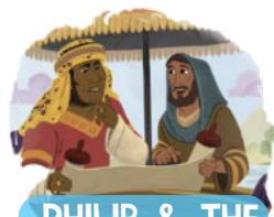
PHILIP & THE ETHIOPIAN