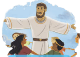
CHILDREN OF GOD