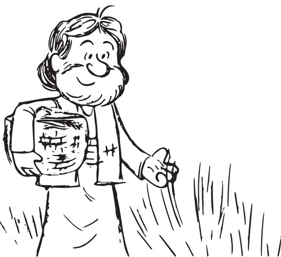
The Story of the Farmer Matthew 13:1-23