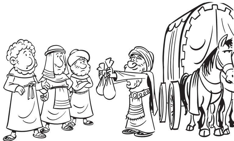
The Parable of the Bags of Gold Matthew 25:14-30 (NIV)

What to Do: Print on cardstock and cut. One set per kid. Page 2 of 2