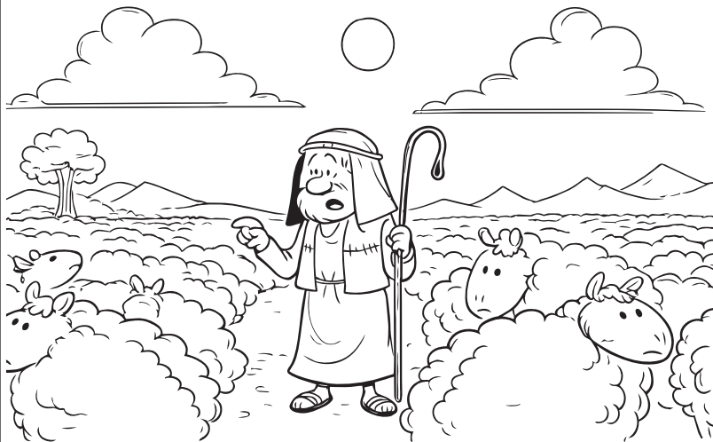
The Story of the Lost Sheep Luke 15:1-7 (supporting: 1 Timothy 1:15)