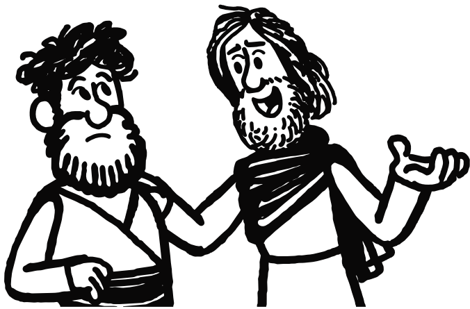
The Story of the Servant Who Had No Mercy Matthew 18:21-35