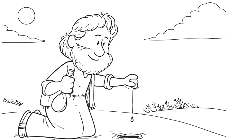
The Stories of the Mustard Seed and the Yeast Matthew 13:31-34