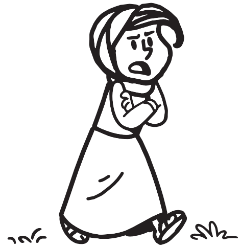
The Story of the Widow Who Would Not Give Up Luke 18:1-8