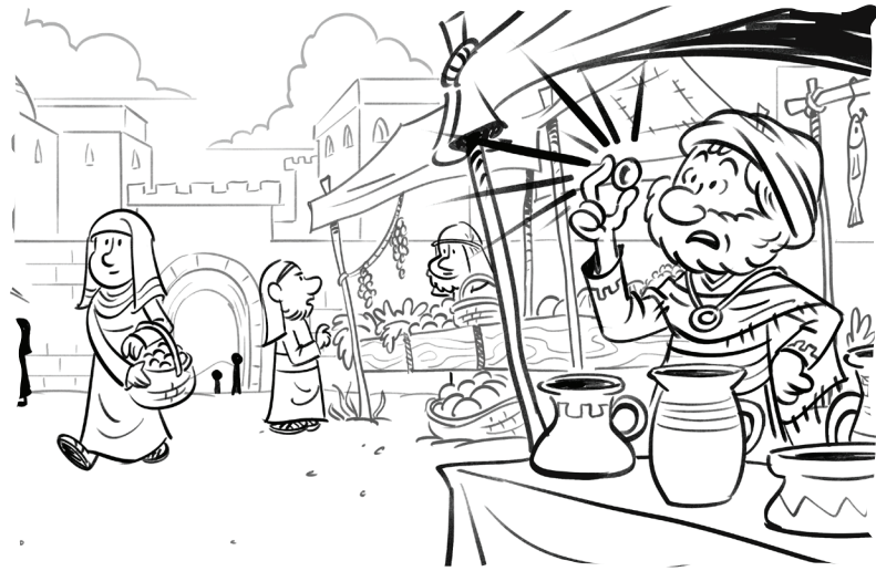
The Stories of the Hidden Treasure and the Pearl Matthew 13:44-46 (supporting: Matthew 4:18-22)