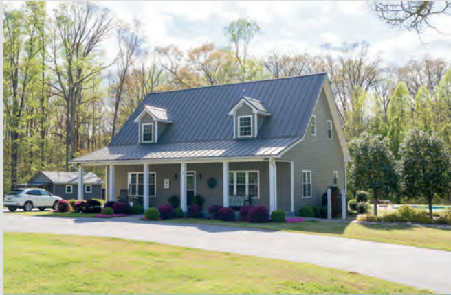
Hannah House - Our Residential Home for ladies Reopening soon!

Our mission is to bring hope, freedom and healing to individuals in need.