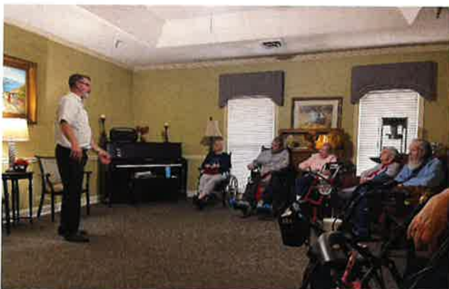
Tuesday Afternoon Woodland Place