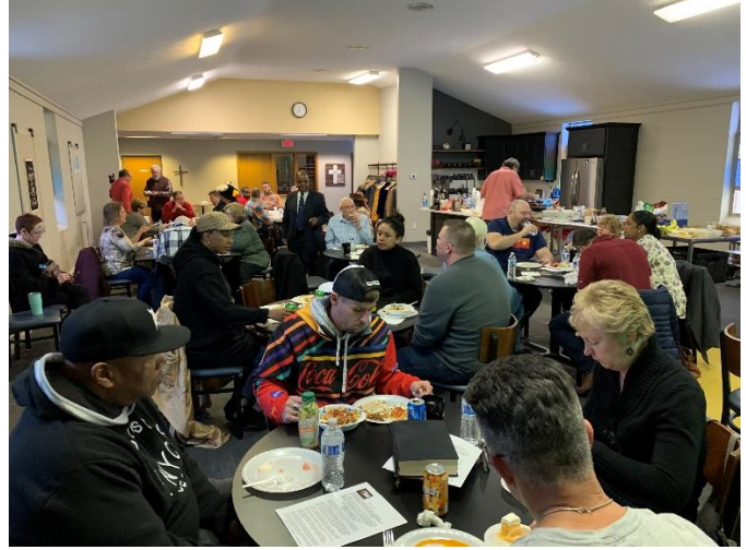
The Fellowship Begins with a Potluck Meal and Conversation