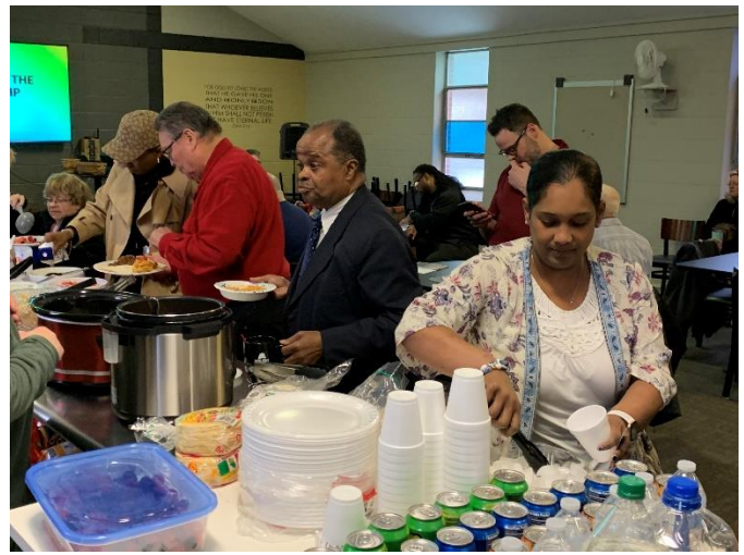
The Fellowship Monday Evening March 13, 2023 in Buck Creek Community Church, Wyoming, MI