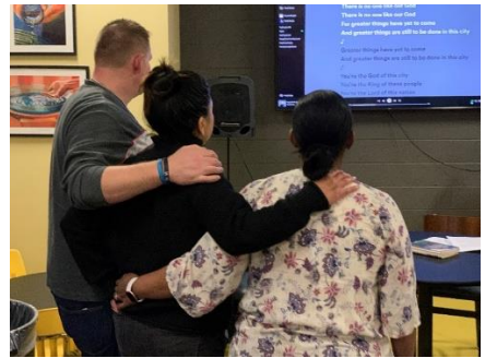
The Fellowship Continues with Worship