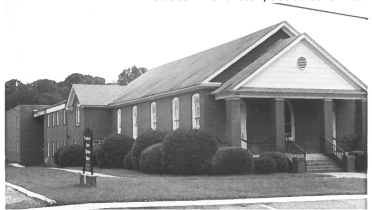
November 1938, new church was completed.