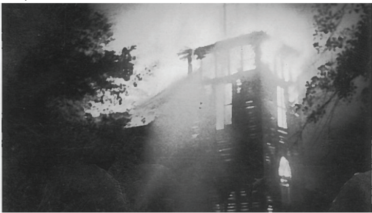
May 1938, fire caused by lightning destroyed the church