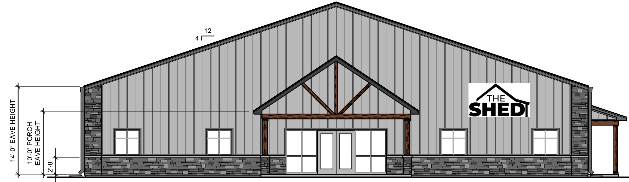
2 FRONT ELEVATION 1/8" = 1'-0"