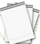
Plastic Shipping Envelopes (including Amazon blue/white mailers)