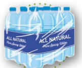
Case Over Wrap