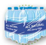
Case Over Wrap