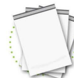
Plastic Shipping Envelopes (including Amazon blue/white mailers)