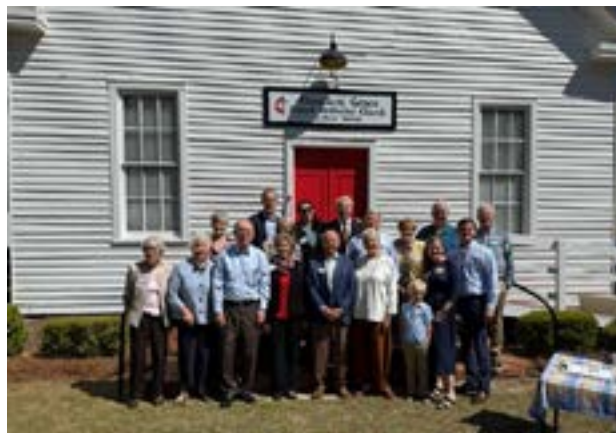
Representatives from Trinity UMC at Abundant Grace UMC on Sunday, March 22, as Open Hearts UMC and Abundant Grace UMC, Trinity's Mission Churches, are officially recognized by the Florida Annual Conference as successful and impactful New Church Starts.