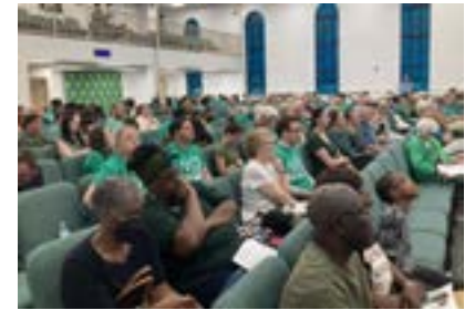
Nehemiah Action audience on April 21

A sea of green filled the Old West Florida Enrichment Center on Tuesday, April 21, for the 2026 Nehemiah InterAction. This year's Action brought together 12 candidates for city commission seats to share their perspectives on affordable housing, food insecurity, gun violence, mental health, and immigration. We celebrated meaningful progress in expanding affordable housing incentives in Tallahassee, heard enlightening and powerful testimonies, and asked the candidates questions about how they would address these challenging issues. Was it different? Yes. Was it still powerful? Absolutely.