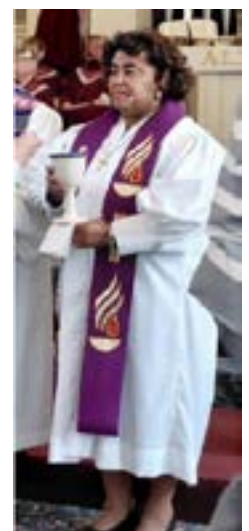
Ivy serving communion