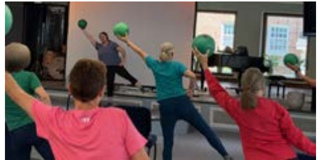
BFC classes meet at Trinity on Tuesdays and Thursdays

Questions? Please call the church office, and our Finance Department will be happy to assist you.