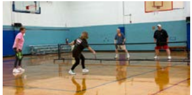
Trinity Pickleball players at First Baptist Church