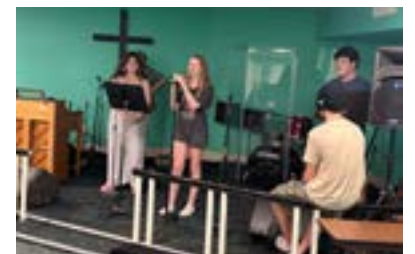
Youth Praise Band