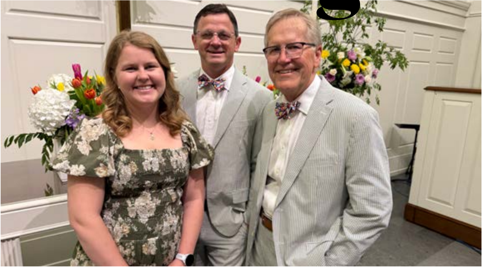
A Monthly Publication from Trinity United Methodist Church, Tallahassee, FL