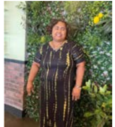
Ivy visiting Dayton, Ohio

Right now, I’m enjoying the view of white dogwood trees, tulips and blue phloxes in Ohio. And I look forward to the differences that are the Florida varieties of plants.