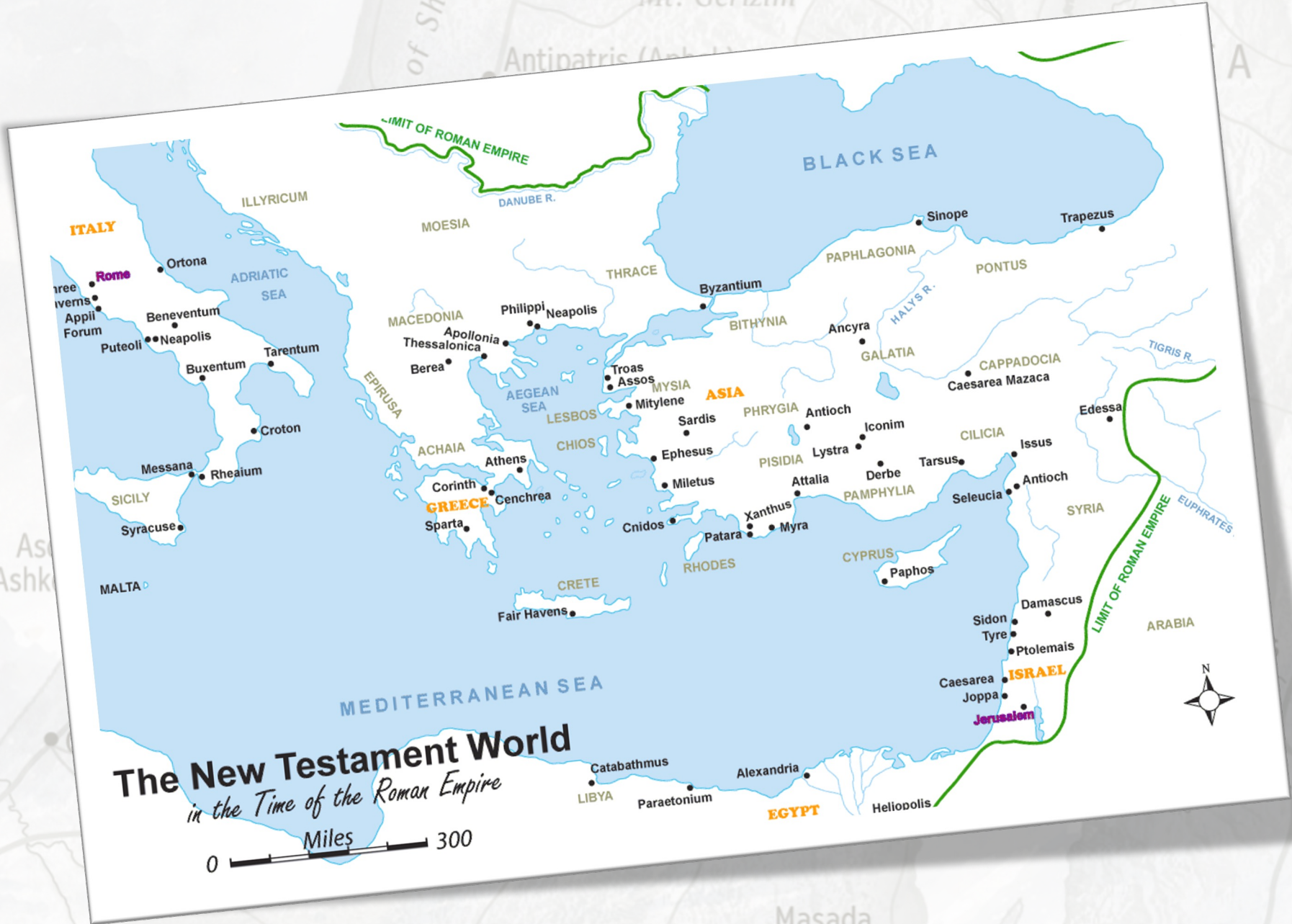
The New Testament World in the Time of the Roman Empire