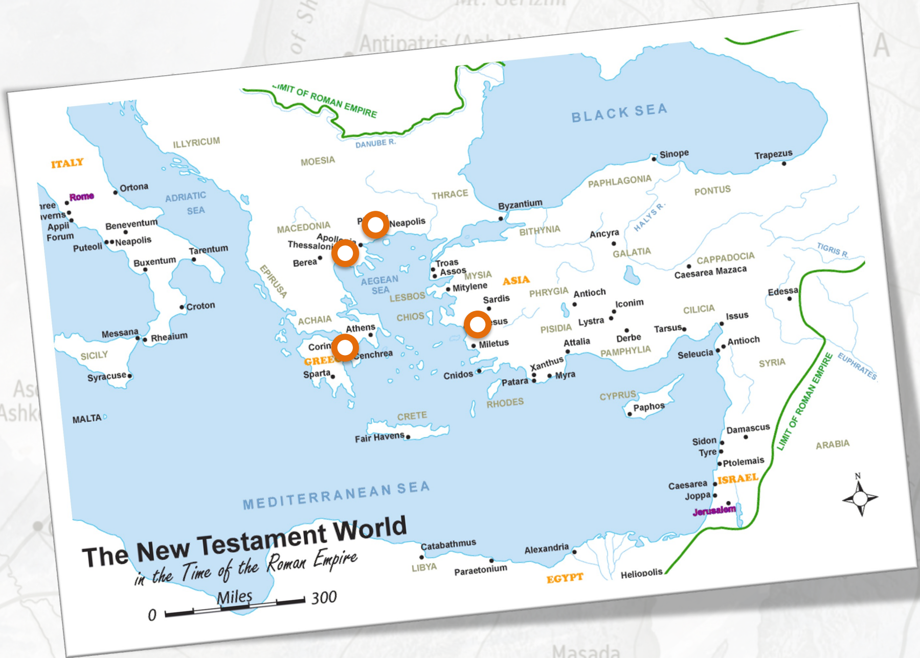
The New Testament World in the Time of the Roman Empire