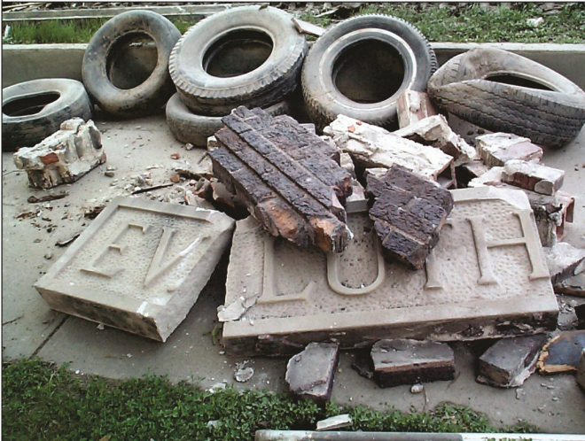
Part of the cement name slab from the top front of the building.

walls. The wood beams were weakening and deteriorating," Stuhr said. "We didn't want to take any chances."