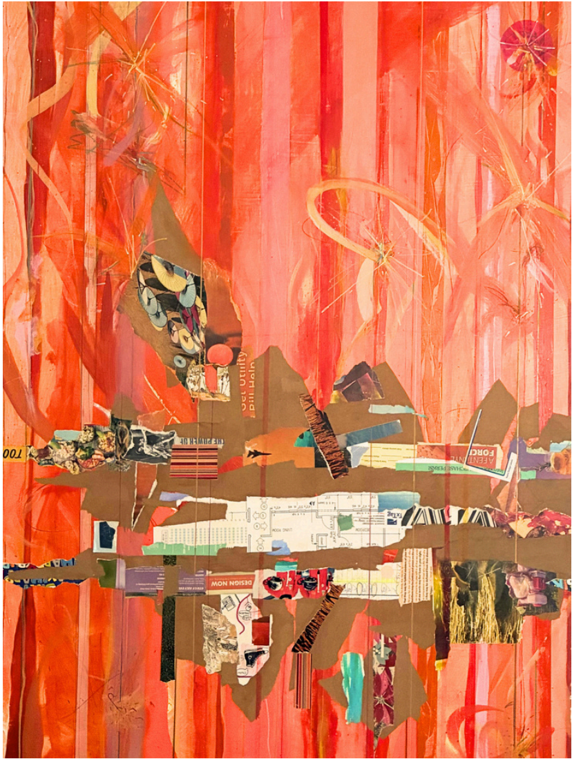
STAT #2 2023 Acrylic & collage 36 x 48 in. $1000