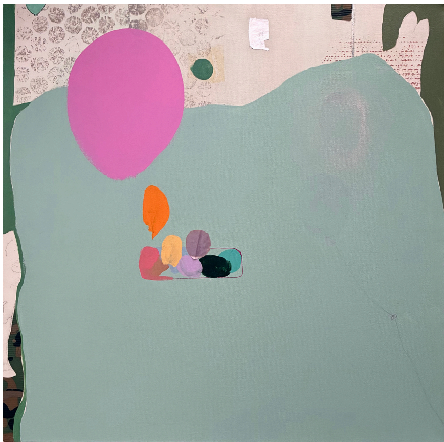
Arriving 2006 Acrylic & tape 24 x 24 in. $450