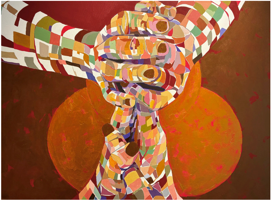
2 or More 2008 Acrylic 36 x 36 in. NFS