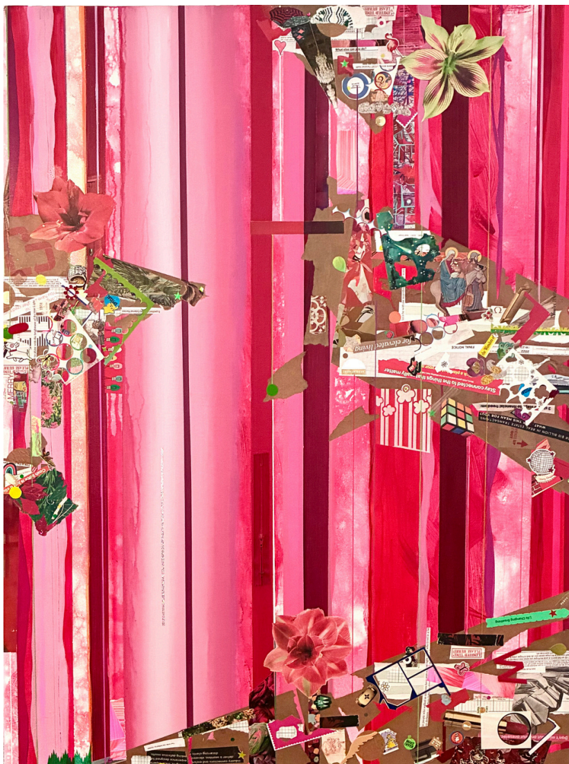
STAT #5 2026 Acrylic & collage 36 x 48 in. $1000