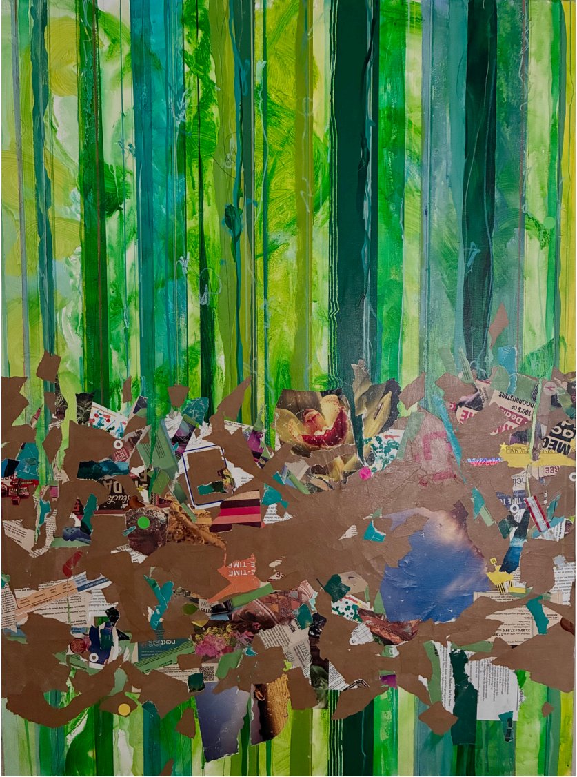
STAT #1 2023 Acrylic & collage 36 x 48 in. $1000