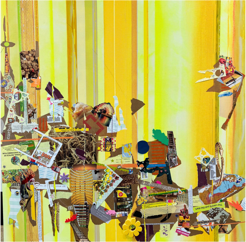
STAT #6 2025 Acrylic & collage 36 x 48 in. $1000