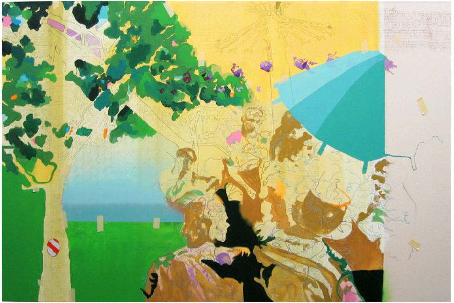
Cool of the Day 2007 Acrylic & tape 84 x 60 in. NFS