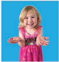
YOUR WILL BE DONE,