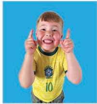
"YOUR KINGDOM COME