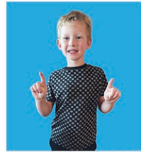
AS IT IS IN HEAVEN."