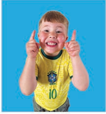
"YOUR KINGDOM COME