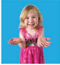
YOUR WILL BE DONE,