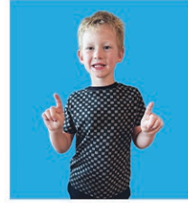
AS IT IS IN HEAVEN."