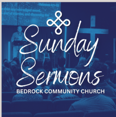
Sunday Morning Sermons

Looking for encouragement throughout your week? Check out our Sunday Sermons podcast to catch up on past sermons. Our Foundation podcast is aimed to give stories that will strengthen your faith. And don't miss our curated Spotify playlist “Take Sunday With You” filled with worship songs to keep your heart centered on Christ wherever you go. Subscribe, listen, and worship with us anytime!