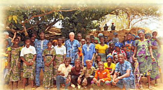
Yinyingou church group