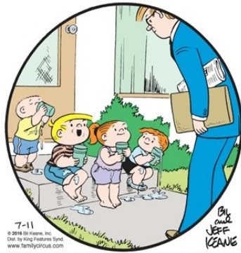
7-11 © 2014 Sil Meade, Inc. Dist. by King Features Synd. www.familycircus.com "We're helpin' Mommy by doin' our spillin' outside." BY: JEFF KEANE

5:00 PM Fellowship Meal 6:00 PM Mission Friends, RA's & GA's 6:00 PM Youth 3rd Floor 6:00 PM Bible Study in Sanctuary 6:00 PM Celebration Choir Rehearsal