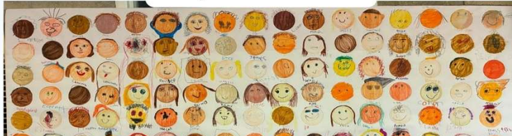
Smiling faces of our VBS kids

EVERYTHING CONTRIBUTED TO A BEAUTIFUL & BLESSED WEEK FOR ALL