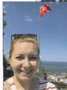
From 2010... to now!

The work of the gospel here in the Middle East is ongoing, and will continue until Jesus returns. To be honest, this is one of the most difficult parts of leaving for me—leaving things “unfinished.” Yet I trust that God will continue to build his Church. It has been an enormous privilege for me to play a small part in this, and I am so grateful for the many, many ways that you also have been a part of fulfilling the Great Commission in this country.