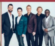
GAITHER VOCAL BAND