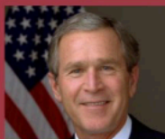
GEORGE W. BUSH