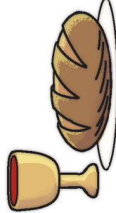
Luke 22:19-20 •