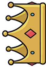
2 Samuel 7:8-16 •