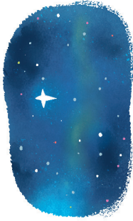
Genesis 12:1-3;15;17 •