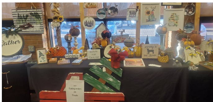
Over 30 booths made shopping fun at the Craft Fair