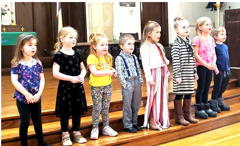
Children from Wednesday and Sunday school sang Apple Red Happiness and Only a Boy Named David during worship Sunday, January 29th.

Grace Lutheran will hold the first service and prepare the luncheon for the March 1 st Community service and meal. A sign-up sheet is available to meet the needs of the luncheon. Twelve members are asked to donate a gallon of chili, cookies or bars, and/or volunteer their time to set up tables, serve the meal and clean up afterwards. Please take time to sign up and offer what you can.