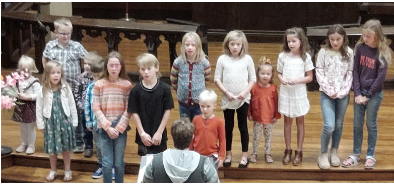
(Pictured at left) Children joined the celebration service on Sunday, September 25th singing for the Thanksgiving and Praise worship for meeting the financial goal of the Raise the Roof project. The goal was met in May but the celebration service was held over until after the business of summer.

A large number of volunteers meet each week to make the 100's of pieces of Lefse for Nordefest Plus. Below, the potato dough is made in to balls to be rolled out. At right bottom, the balls are floured and place on a lefse pastry cloth and rolled out very carefully. The dough is then place on the griddle to fry on each side, then cooled. Picture at top right, the floor on the lefse is then dusted off and packaged for purchase at 9:30 am the day of Nordefest Plus.