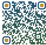
Volunteer to serve