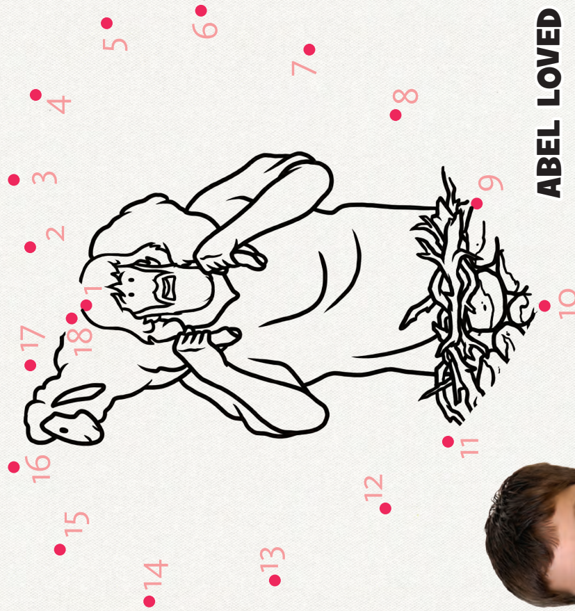
ABEL LOVED GOD

Start at 1 and draw a line to the next number. Keep going in order.