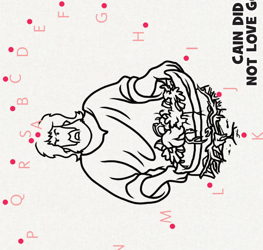
CAIN DID NOT LOVE GOD

Start at A and draw a line to the next letter. Keep going in order until the picture is finished.