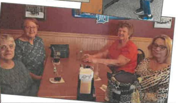
The Singles Ministry at St. Paul Lutheran gathered for fellowship, conversation, and encouragement in faith. It was a meaningful time of connection as members shared life together and strengthened one another in Christ-centered community.