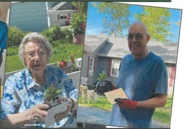
The Ray of Sunshine Ministry delivered 19 plants to our shut-ins this week. The plants were lovingly potted by CIA (Christians in Action) and shared as a reminder of God's love and the care of their church family.