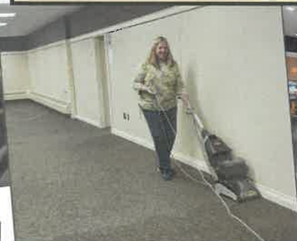
A huge thank you to all those who stayed and helped clean up the Fellowship Hall dining room after another successful rummage sale.