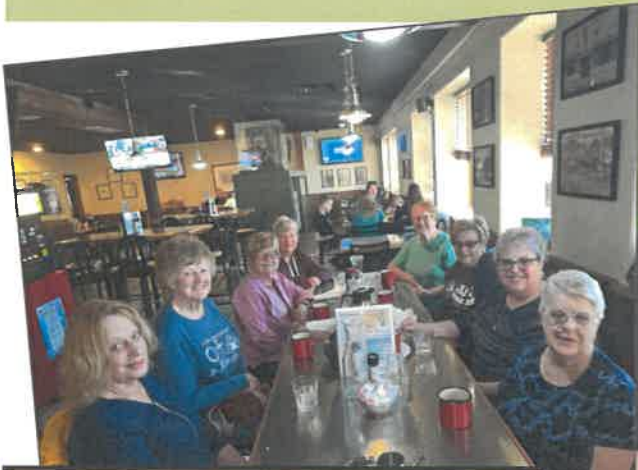
The Breakfast Belles gathered for their weekly breakfast and conversation. It was a time filled with laughter, friendship, and faith-filled discussion, it's always a wonderful way to start the day! All women are invited to join us every Wednesday at 7:30 a.m. at JJ's.