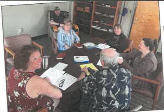
The staff of St. Paul Lutheran gathered Thursday morning for their regular meeting, spending time discussing both the challenges we face and the opportunities before us.