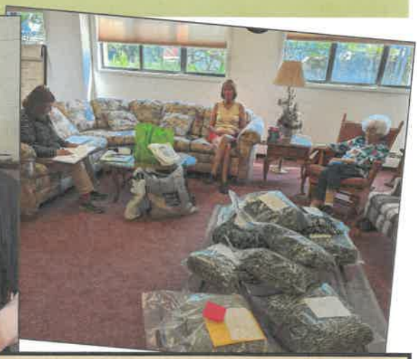
The Prayer Shawl Ministry gathered for their regular meeting lifting prayers over each shawl as they were prepared to be shared with those in need of comfort and care. During the gathering, special prayers were also offered for our graduates as they prepare for the next chapter of their journey.