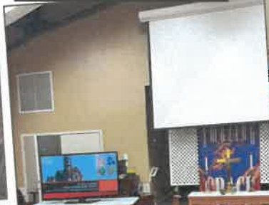
A new screen, a continued commitment to worship! After our projector began experiencing issues, the TV from the church lounge was brought into the Multi-Purpose Room to serve as a display for our 10:30 a.m. Sunday Contemporary Service.