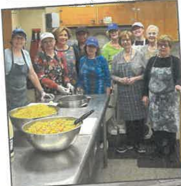
The Dinner on a Doorknob committee was busy preparing meals for many members of our church and those within our community who were experiencing a difficult situation or a joyful situation. This ministry is truly a blessing to our church and community!