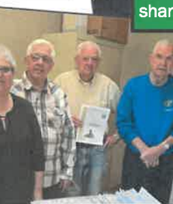
The Newsletter Team gathered at St. Paul Lutheran, continuing their faithful work behind the scenes to help keep our church family informed, connected, and encouraged.