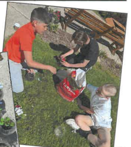
The CIA planted flowers for our shut-ins today, to share a little bit of God's beauty within their homes.