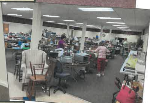
The Rummage Sale at St. Paul Lutheran was a great success, thanks to all who worked and donated!