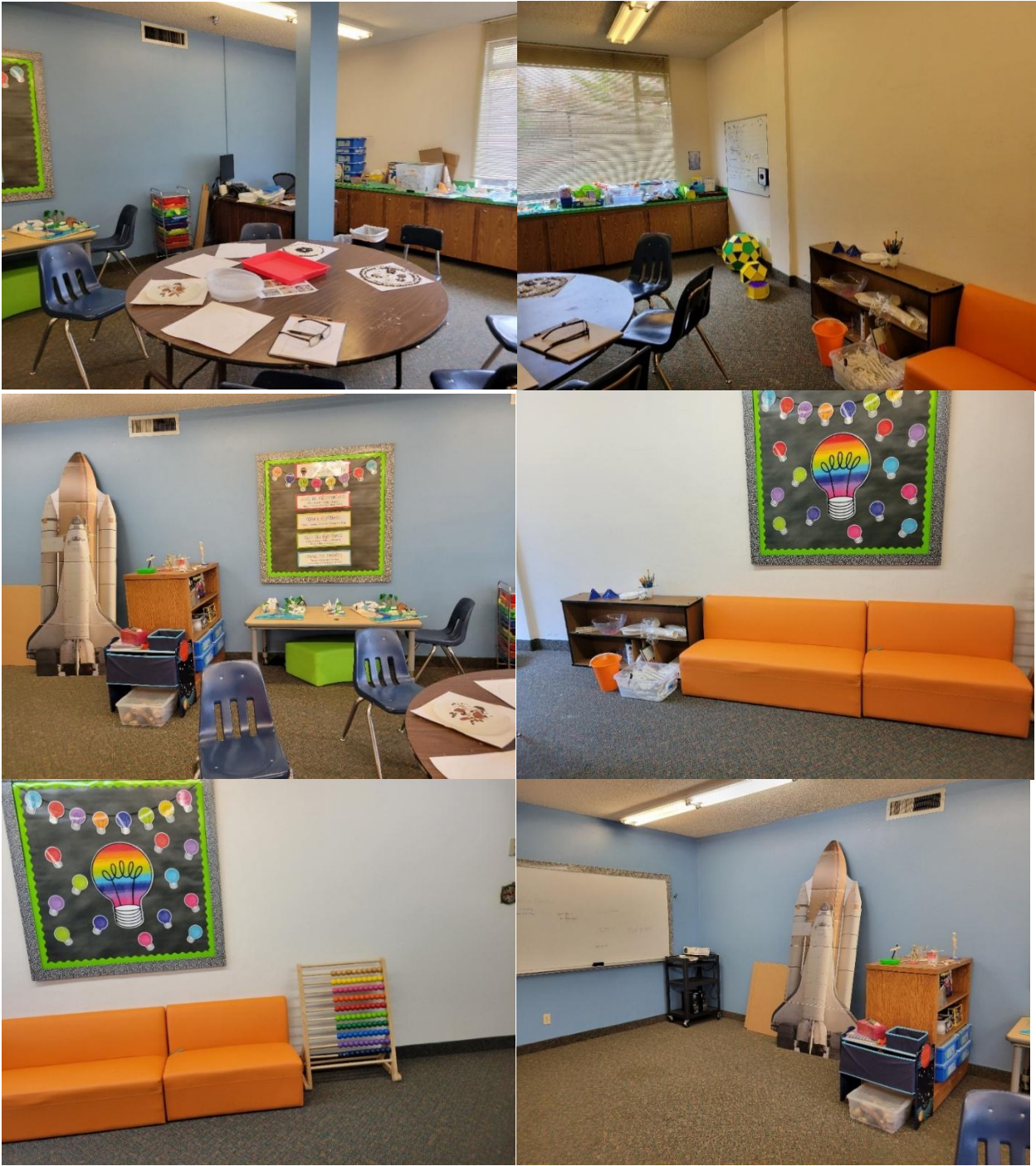
Room 104 Church-Owned