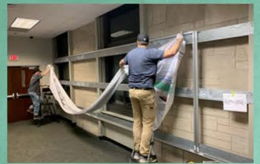
Hanging the fabric mural: GDS Display