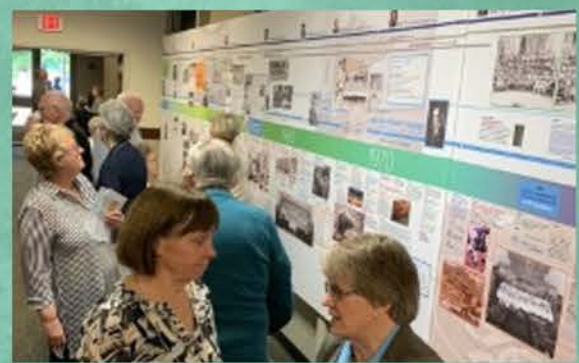
Heritage Hallway - final layout