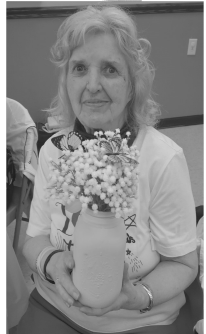
Mother's Day Banquet Door Prize Winner