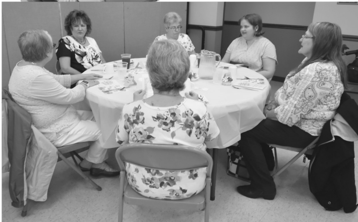
Purls of Prayer ladies