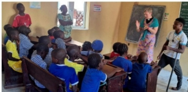
Greeting students in sign language (with the teacher's help) at the Lutheran Church of Christ in Nigeria school for deaf students

Another part of my role is to facilitate grants our companions receive from the ELCA. During my visits, I make sure to visit communities and church workers who lead grant supported projects. Then, I can share with you, as members of the ELCA, the good work of God we are doing together.