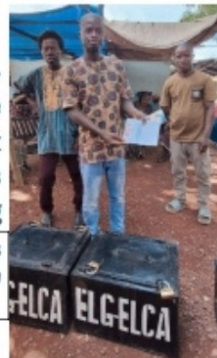
Leaders of a Village Savings Program run by the Lutheran Church in Guinea.