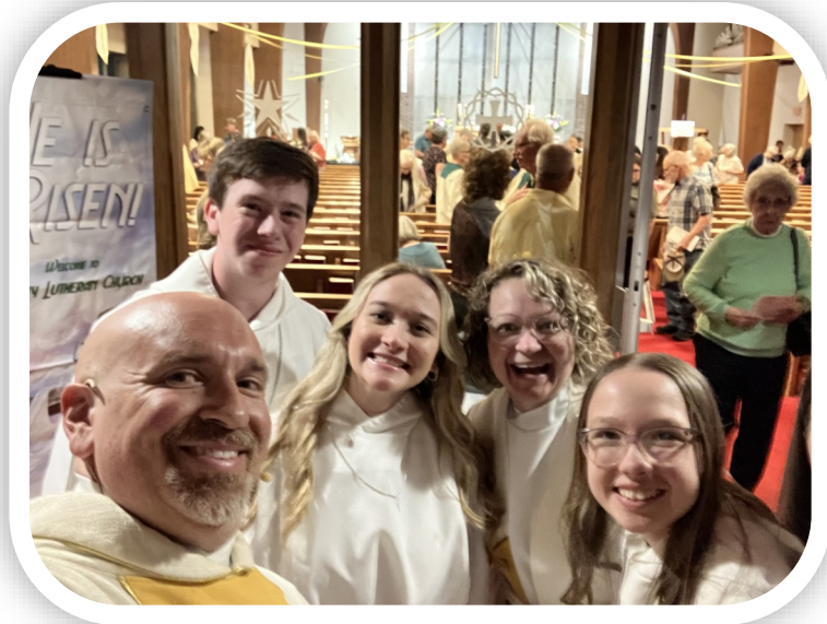
Some of our teenage worship servants from Easter Vigil