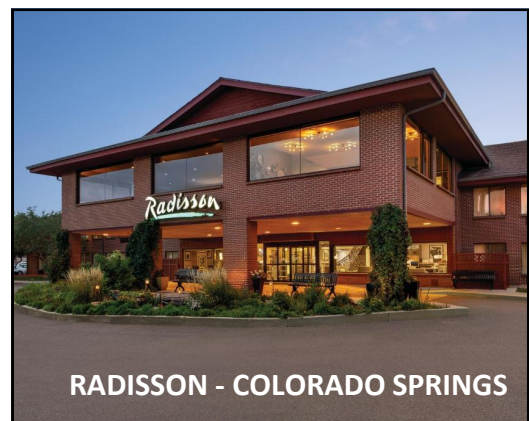
COLORADO 2026 - THE TRIP OF A LIFETIME

What to bring - comfortable shoes, layers (we are in the mountains in the Fall avg temps in the 50-70's), headphones if you want to listen to your devices (respect others), and a good attitude (traveling with 50+ people can have its moments).