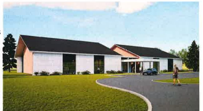
Architeturual rendering of the new Co-Op exterior

The Food and Clothing Co-op supplies seminarians and their families with food, clothing, and household items at no cost, easing the burdens of study and daily life. A new co-op with more space and easier access will allow this vital work of mercy to continue with greater effectiveness, supporting those who prepare here to serve Christ's flock.