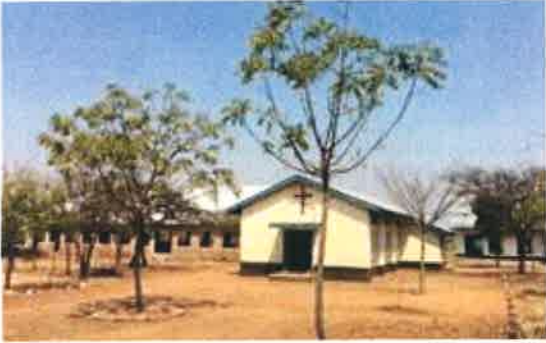
Picture of the Training Center

Tanzania is one of the most culturally diverse countries in Africa, with over 120 tribes, each with their own tribal language which is learned in the home from birth. Swahili becomes the second language, and used almost exclusively in primary schools, resulting in 90% of the population being conversant in Swahili as a common language. English training begins in secondary schools.