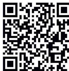
Scan QR to register!

This workshop is for writers of all experience levels and will focus on fiction. Sessions are Sundays after the service beginning on June 21. There will be breaks on July 5, July 26, and one Sunday in August. You are encouraged to register at the Welcome Center so we can prepare materials, but everyone is welcome. Even if you can't make it every week, please come when you can! You're also invited to join the WordWorkers group on the All Saints App. Connect with other writers to get the feedback and encouragement you need!