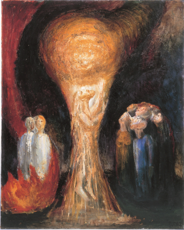
Peter Rogers - The ascension, 1963