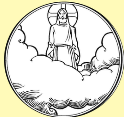
"While he blessed them, he parted from them and was carried up into heaven." (Luke 24:51)