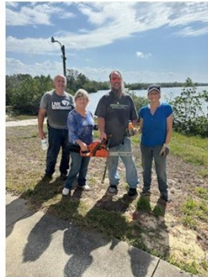
Mission Trip— Florida