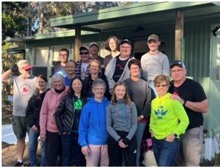
Mission Trip— North Carolina