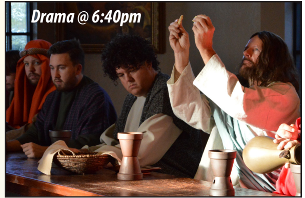
Drama @ 6:40pm