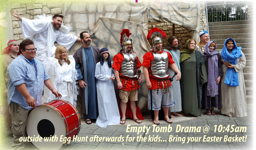
Empty Tomb Drama @ 10:45am

outside with Egg Hunt afterwards for the kids... Bring your Easter Basket!