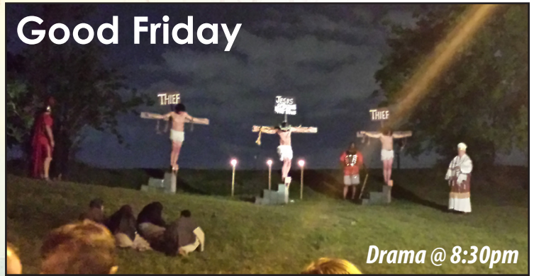
Drama @ 8:30pm