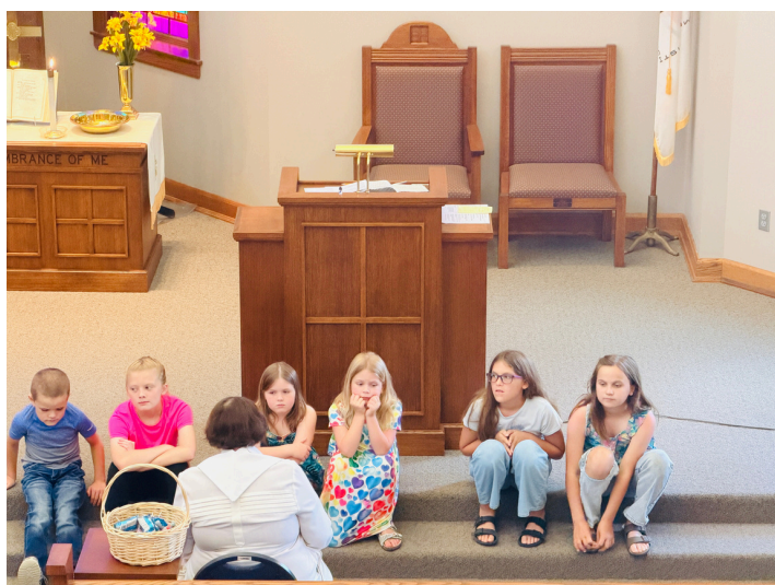
Young disciples moment May 17th

"May he give you the desire of your heart and make all your plans succeed." Psalm 20:4