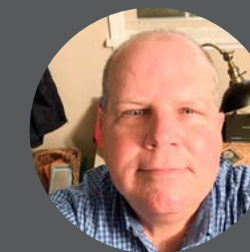
Parrish Alford Widow Ministry