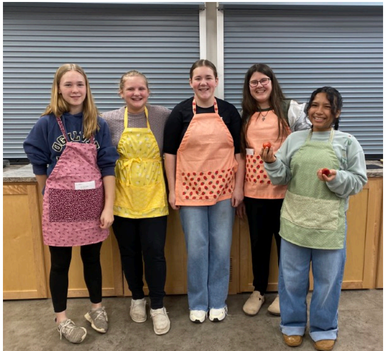
They all did a great job on their aprons!