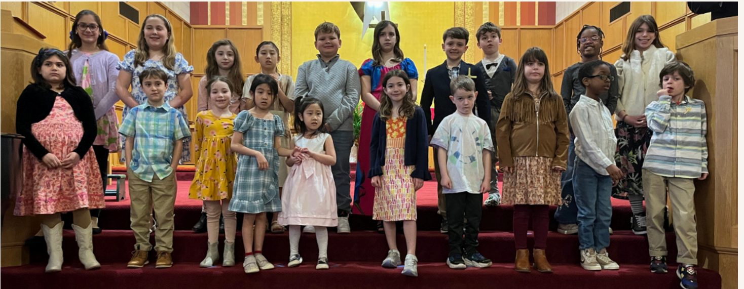
During Palm Sunday worship, children and youth read the Gospel readings depicting the events of Holy Week. Afterwards, the youth hid candy-filled eggs and the children hunted for them.