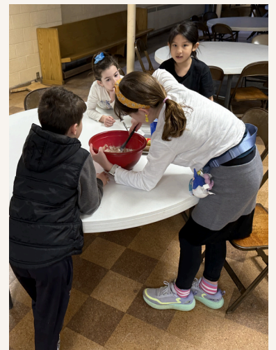
Spark Church has been exploring Holy Week and made communion bread to serve to the congregation on Maundy Thursday and Easter. We remembered God's work in us as we worked the dough.