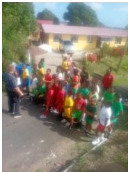
Cross Country Run