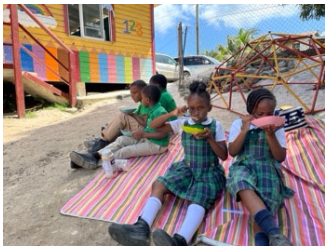
A bowl of ice-cream