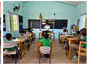
Learning in class