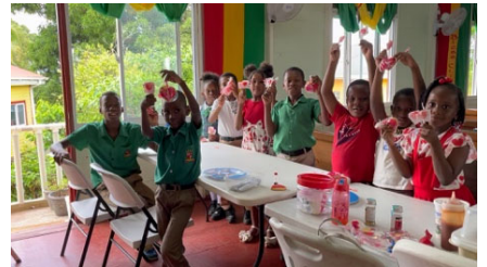
Valentine's Party, decorating heart shape sugar cookies, ice-cream