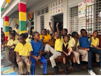
Assembly and lunch time Bible Club