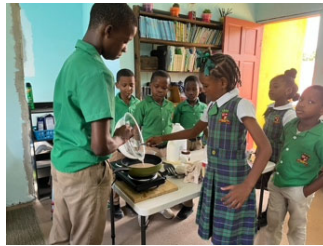
Making play doughs