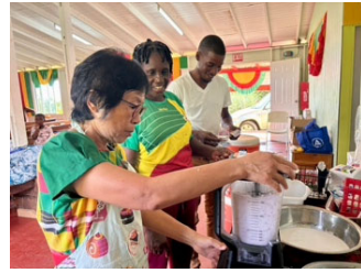
Celebrating Independence Day